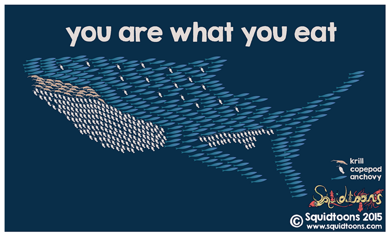
Fig. 2. Cartoon demonstrating the simple concept of trophic ecology.