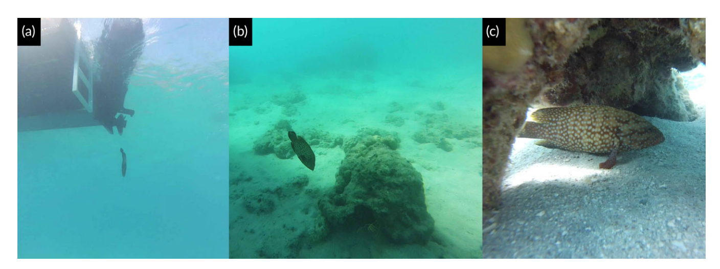
FIGURE 1 Screen captures from videos recorded during behavioural trials with Cephalopholis cyanostigma , showing (a) the fish during its initial descent from the release point at the stern of the boat, (b) the fish approaching the small coral structure that was positioned near the boat and (c) the fish in position within the reef shelter

On September 4 and September 9, 2014, fish were transported in water-filled containers (control water) by boat to a field location near LIRS for release (between 0900 and 1100 hours). In each case, fish were in their exposure treatments for 8–9 days prior to release. The release site was c . 5 m deep and surrounded by an open sandy bottom