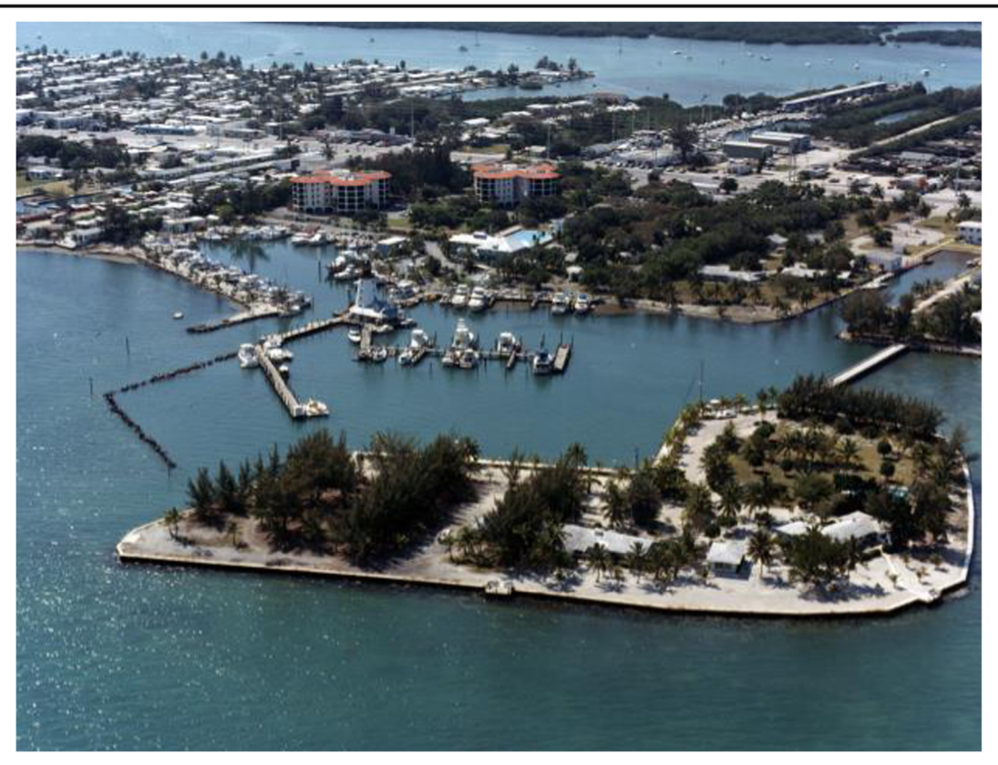
Fig. 2 An aerial photograph of Marathon, Florida in 1987. Significant coastal development has occurred in many regions of South Florida, changing coastal habitats from natural vegetated shorelines to concrete seawalls. Both habitat loss and urban

until it was banned in 1985 (Frezza and Clem 2015). Similarly, harvest by recreational anglers was also common (Fig. 3) until it became prohibited by law in 2011 (Ault et al. 2008a). Although it is unclear whether overexploitation had a significant effect on bonefish populations historically, given their life history characteristics (maximum age 21 years, age of maturity ~4 years; Crabtree et al. 1996, 1997), overexploitation via harvest is unlikely to be the major cause of low contemporary bonefish population sizes. Furthermore, Rehage et al. (In Review) found declines in bonefish abundance actually preceded declines in bonefish size. This is atypical of fisheries induced population declines observed in numerous other species, which usually involve declines in mean size prior to population crashes (Pauly et al. 1998; Rosenberg 2003).