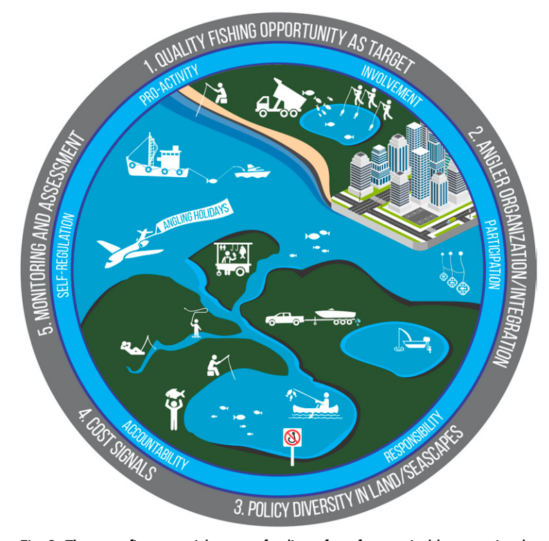
Fig. 2. There are five essential tenets of policy reform for sustainable recreational fisheries (outer ring). And there are several supposed impacts on angler and manager incentives (inner ring). Recreational fisheries are quite diverse in terms of their motives, habitats, and impacts (center image). Image credit: Sign Art Studio.

Second, anglers must be better organized and involved in management processes. Although governance systems for recreational fisheries are in place in many developed nations, even wealthy countries struggle to integrate recreational fisheries effectively into the fishery policy and assessment system. For example, the European Union continues to keep recreational