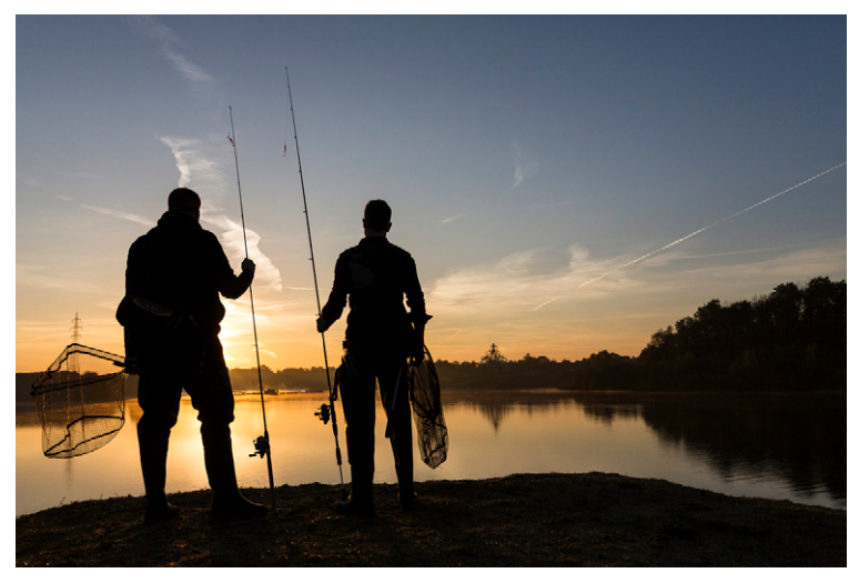
For too long, the considerable importance and impacts of recreational fisheries have been ignored.

Although commercial capture fisheries globally harvest about 8 times the fish biomass caught by recreational fisheries (4), in many localities recreational landings now rival or even exceed the biomass removals by commercial fisheries. In inland waters in the temperate zone, recreational anglers are now the predominant users of wild fish stocks (5), and recreational fishers have become prevalent in many coastal and marine fisheries (6, 7). Globally, recreational fishers catch about 47 billion individual fish per year, of which more than half are released alive (4), either because of harvest regulations or in response to personal ethics (8). Despite high release rates, fishing for food is a