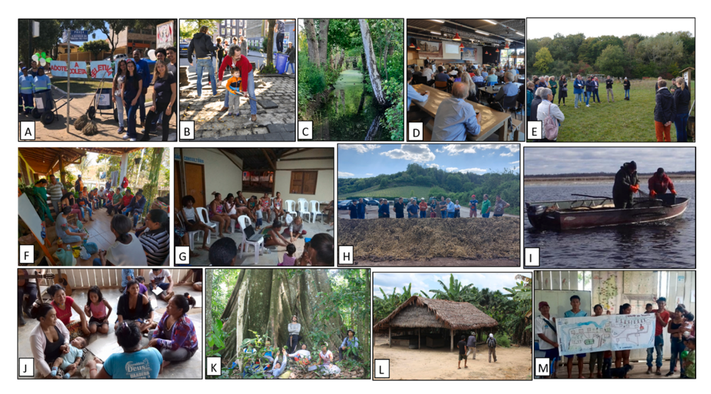
Fig. 3. Co-production activities and/or their contexts. A: Case 1; B: Case 2; C: Case 3; D: Case 4; E: Case 5; F: Case 6; G: Case 7: H: Case 8; I: Case 9; J: Case10; K: 11; L: 12; M: 13.