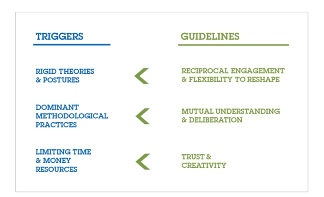
Fig. 1. Triggers related to challenges of knowledge differences and power imbalances with guidelines for actors to address them.

The lack of time and material resources reflects the structural limitations of academia and commodified research that underfund coproduction while putting emphasis on competition between its actors, including IPLCs. The same limitations are found in projects of policies and NGOs that address co-production with IPLCs. Although these limitations require structural responses, scientists are challenged to mitigate them by cultivating trust and creativity. Participatory processes take