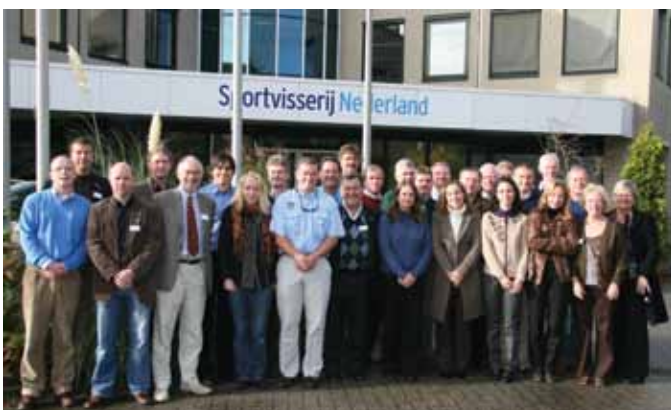
Figure 3. Participants of the Workshop on the EIFAC Code of Practice for Recreational Fisheries at the Dutch Angler Association in Bilthoven, The Netherlands, November 2007.