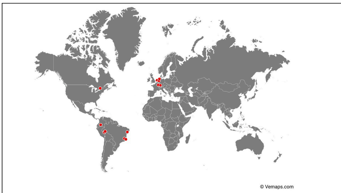
Fig. 2. Map with locations of the study areas where thirteen co-production case studies explored in the article were carried out.