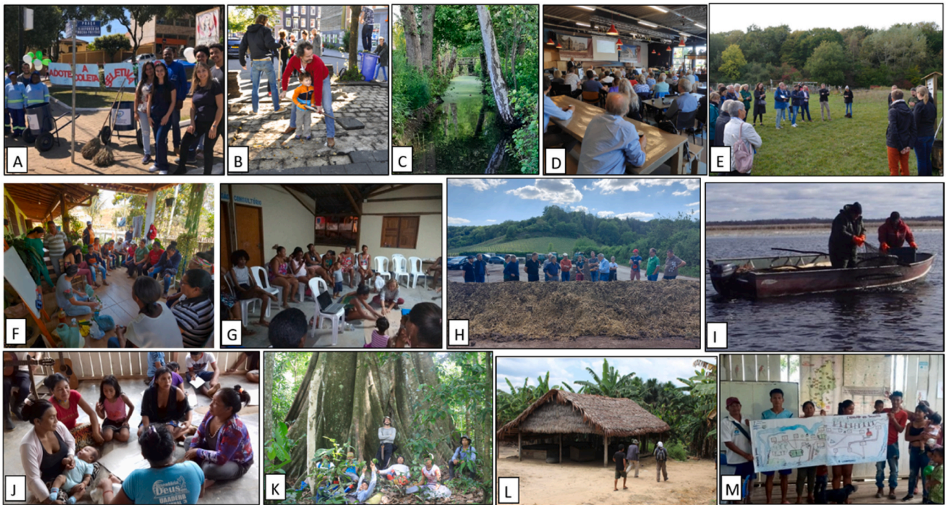
Fig. 3. Co-production activities and/or their contexts. A: Case 1; B: Case 2; C: Case 3; D: Case 4; E: Case 5; F: Case 6; G: Case 7; H: Case 8; I: Case 9; J: Case 10; K: 11; L: 12; M: 13.